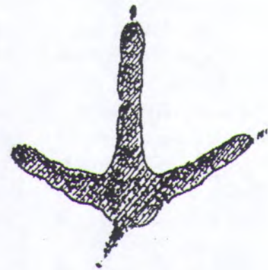
Lesser prairie-chicken track